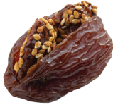
Sesame & Five Spices