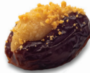
Orange Blossom Almond